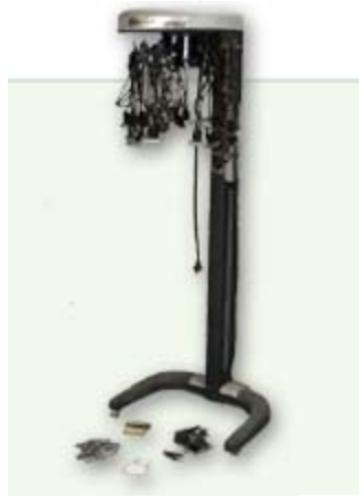
Permanent wave machine

How it worked: Place a lock of hair in the "Rub-O-Felt" protector and then you pulled the felt close to the scalp (or as far up as the hair was to be curled). The hair was then wet with a waving solution. The end of the lock was wrapped in a foil and cloth wrapper. The lock was wound around a roller and more solution was applied. Then the roller was wound around the lock as far as the hair was to be curled (in any case no farther than the protector pad) and fastened in place in one of the rubber and metal guards. A heated curler was attached to the roller. The usual time heating time was 7 minutes. ( Unknown )