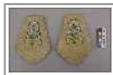
moccasin vamps III-H-92 a-b