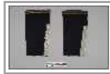
leggings III-I-531 a,b