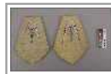
moccasin vamps III-H-95 a-b