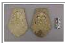
moccasin vamps III-H-93 a-b