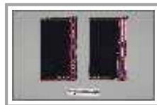
leggings III-H-272 a-b