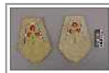
moccasin vamps III-H-91 a-b