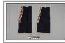
leggings III-I-530 a-b