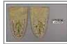
moccasin vamps III-H-313 a-b