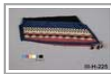
moccasin vamp III-H-225