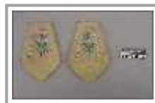
moccasin vamps III-H-96 a-b