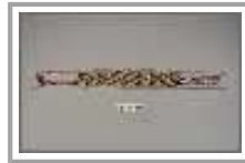
ceinture fléchée III-I-540