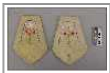
moccasin vamps III-H-94 a-b