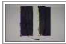
leggings III-I-238 a-b