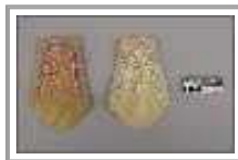
moccasin vamps III-H-311 a-b