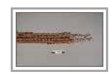
ceinture fléchée III-H-121